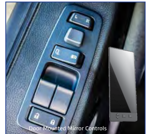
Door Mounted Mirror Controls